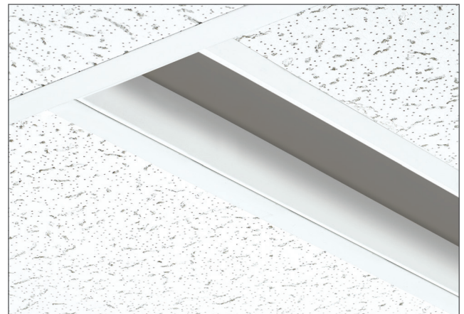
MERGE shown lay-in

Notes: Typical max run length is 40' for the low-voltage bus which can be powered from both sides for a total of 80'; system wattage will impact max run length