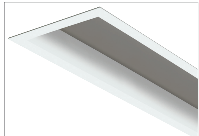
MERGE shown flanged