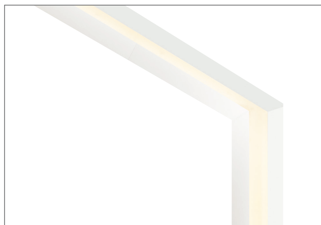
MERGE shown flangeless

Max run length is 80' for the channel; typical max run length is 40' for the low-voltage bus which can be powered from both sides for a total of 80'; system wattage will impact max run length