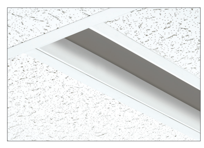
MERGE shown lay-in