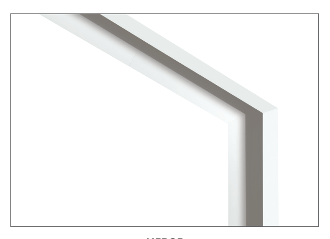
MERGE shown flangeless