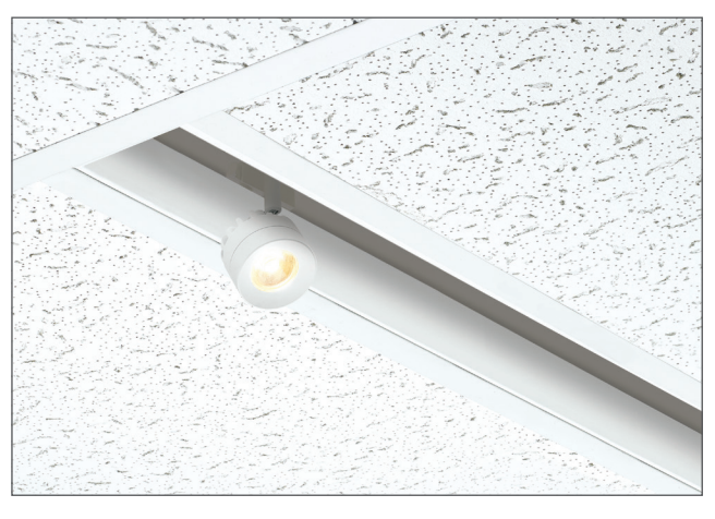
MERGE shown lay-in